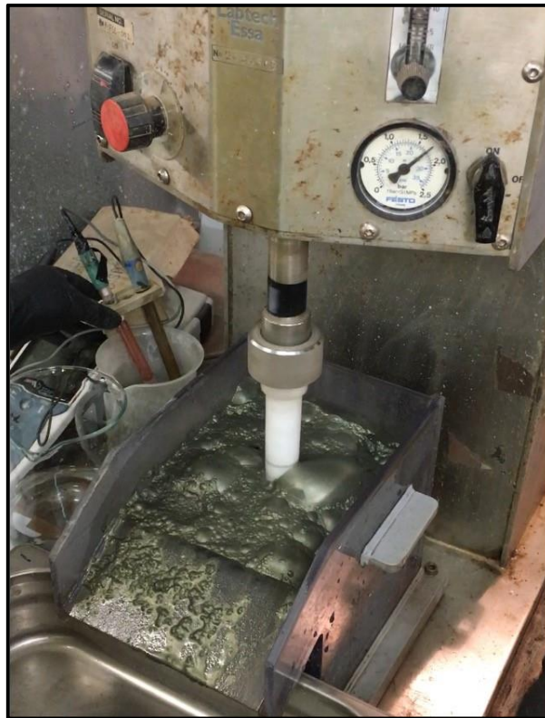
Figure 1: Minyari Deposit metallurgical test-work copper sulphide float

During the 2017 gold focussed test-work total gold recovery of up to 97.1% was achieved via conventional gravity and cyanide leach processing techniques. Test-work undertaken in 2018 focussed on flotation (Figure 1) and gravity processing techniques and intermediate concentrates containing gold and base metals grading up to 432 g/t gold, 21.9% copper and 11% cobalt were achieved. Overall, the 2017 and 2018 gold and by-product metallurgical programmes on the various Minyari Dome ores have produced extremely positive and encouraging results. The ore has demonstrated that it is amenable to conventional processing techniques. A process plant using well established and proven equipment is envisaged.