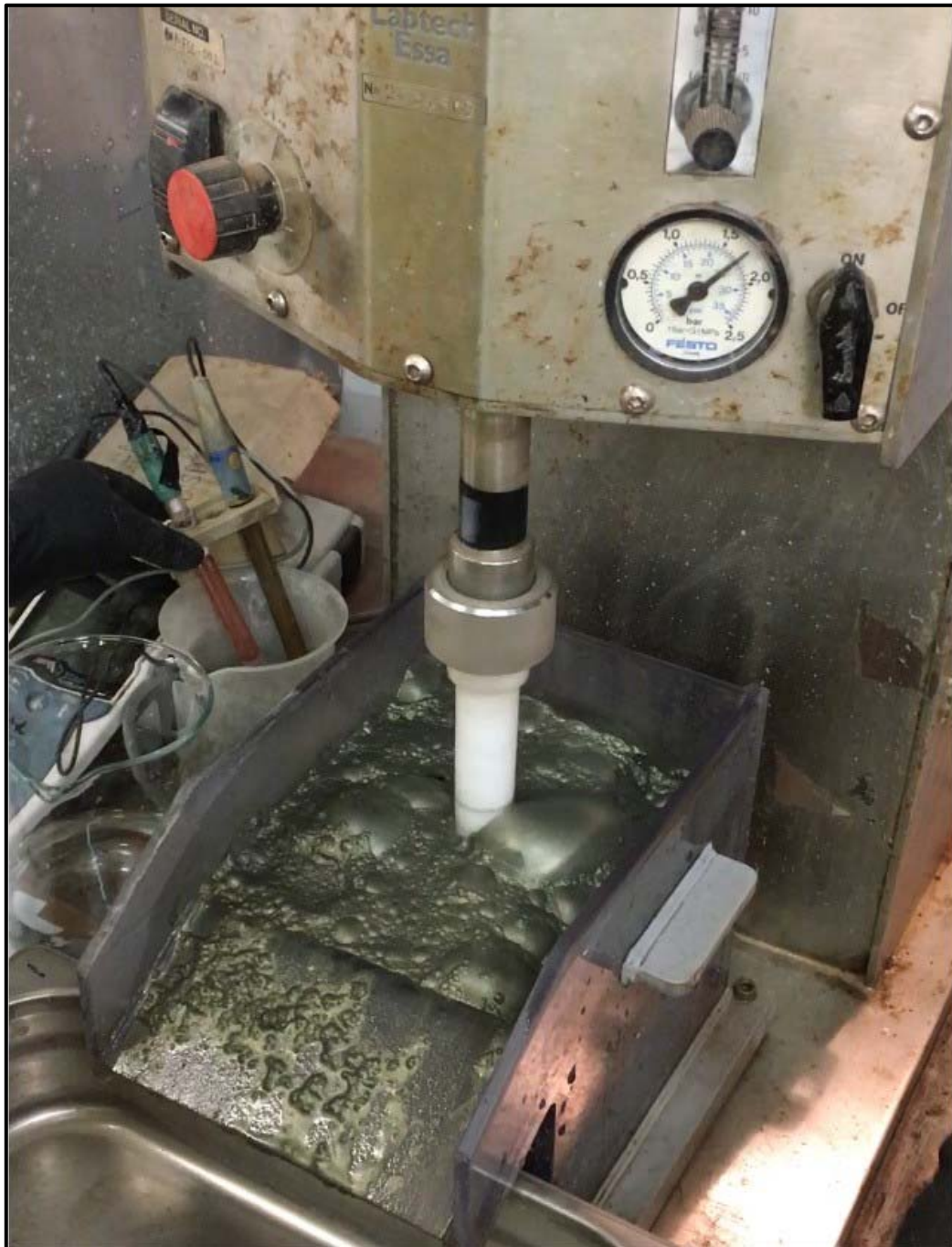
Figure 1: Minyari Deposit metallurgical test work sulphide float